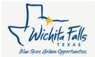
City of Wichita Falls Boards & Commissions

Currently, the city of Wichita Falls has vacancies on the following boards and commissions: